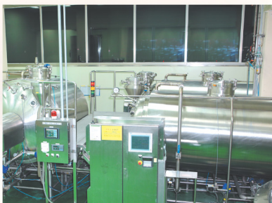
Unit cooker with coolers