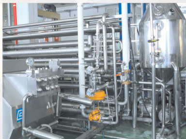
Homogenizer & Pasteurizer